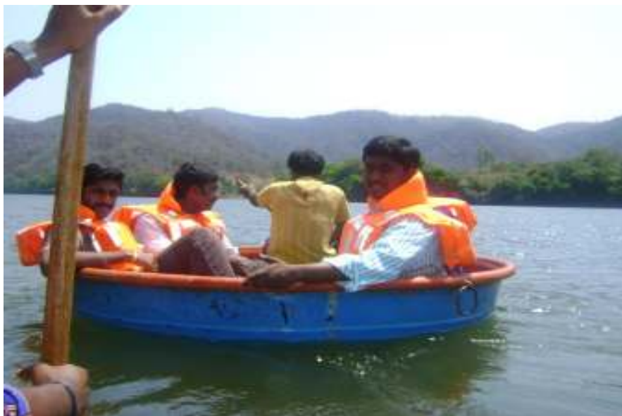
(travel in a manual boat)

When we were finished, we were getting ready to travel in a manual boat. As many our volunteers don't know swimming we had to seek the help of a life jacket. Then they compelled all of us to wear a life jacket. As soon as we wore a life jacket it just looked like a bullet proof jacket. But the volunteers who wore the jacket found out a whistle hanging with it and they started whistling. And there were jackets without whistles they had to change their jackets which made them really confident while boating.