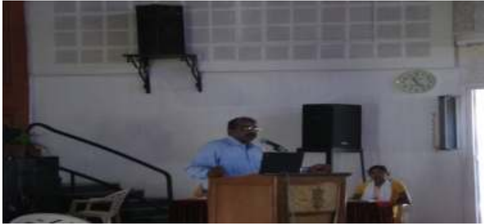
(A guest lecture)