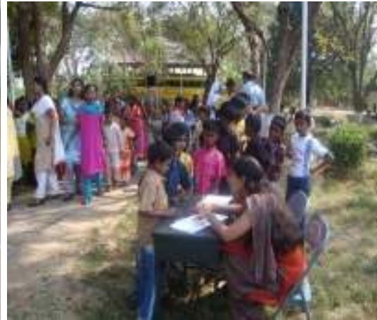
(Registration of SEESHA students)