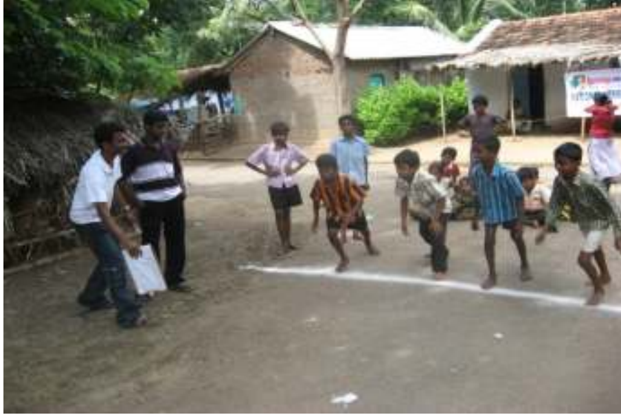
(NSS volunteer conducting games for village children)