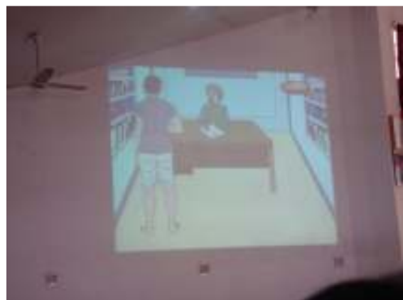
(Projected awareness videos)