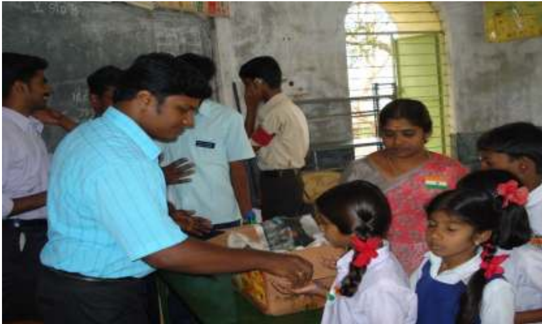
(NSS volunteers distributed sweets to the school children)

In the view of 56 th Republic day function the NSS volunteers visited Eight Adopted schools. The NSS volunteers distributed sweets to the school children. Nearly 150 volunteers visited the school at about 9.00 AM and returned at about 10 AM. After that NSS volunteers projected awareness videos in the adopted villages.