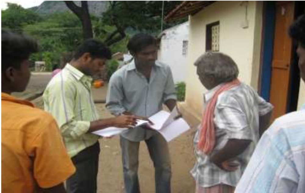
(Volunteers taking Child Labour Survey)

With a crew of 97 volunteers, as helping the Child Labour Department of Coimbatore, our Karunya NSS unit surveyed the villages in and around pooluvapatti panchayat, to abolish the child labour. The survey was dated on 21 th of July '08. The villages surveyed are pooluvapatti, Nathegoundanpudhur, Kilikoundanpalayam, Vadivelampalayam, Molapalayam, Spic, Seenevaspuram, Valayankotai, kalimangalam, Alandurai, etc. The child labour survey project was completed successfully by surveying around 1500 houses.