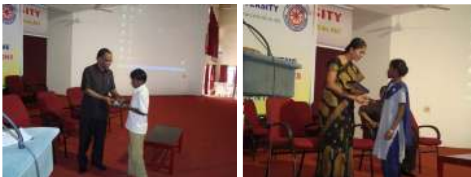
(Distributing prizes to SEESHA students)