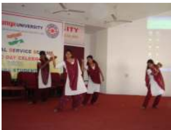
(Conducting cultural by NSS Volunteers)