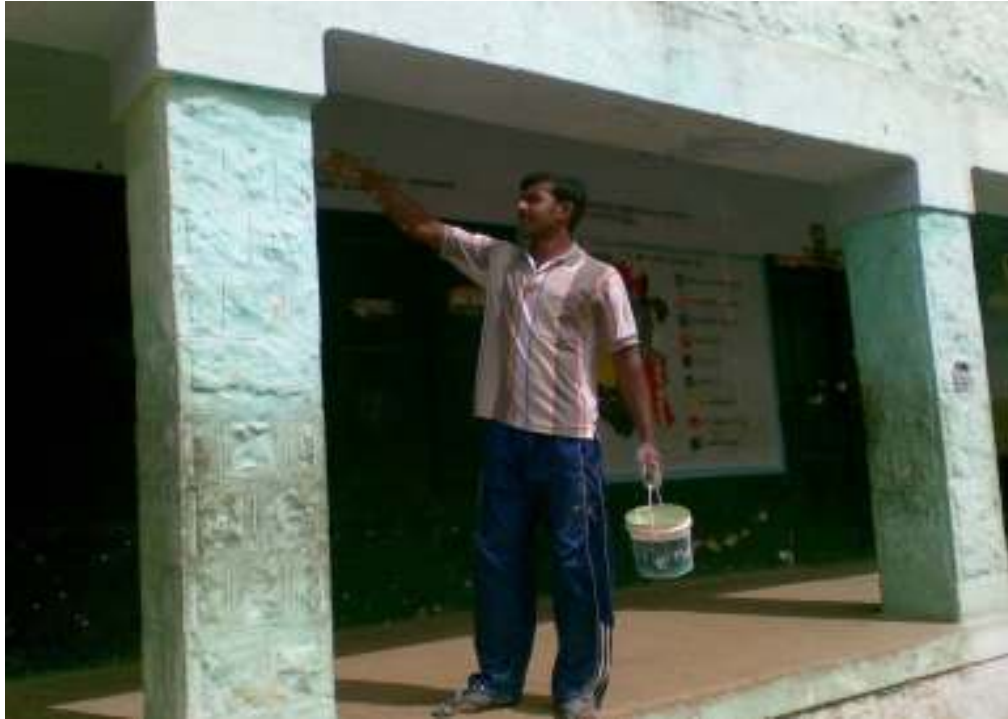
(volunteers took part in white washing)

By considering the requisition of Semmedu- Elementary school Head master, our NSS unit with 27 volunteers took part in white washing of the school premises on 2 nd and 3 rd Aug '08. The white washing was done within 2 days which covered School's compound wall, class rooms, black boards, ceilings and roofs.