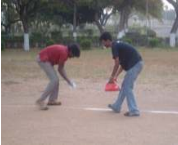
(Preparation work in EMS ground)