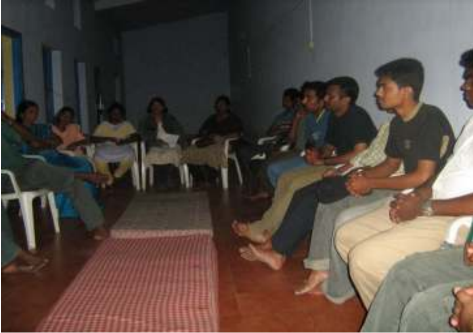
(Attending seminar about ecosystem)