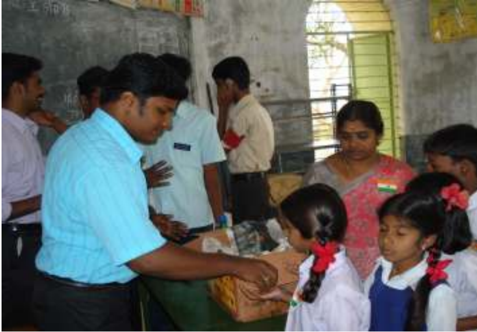
( NSS volunteers distributed sweets to the school children)

In the view of 62 th Independence Day function the NSS volunteers visited Eight Adopted schools. The NSS volunteers distributed sweets to the school children. Nearly 20 volunteers visited the school at about 9.00 AM and returned at about 12 AM.