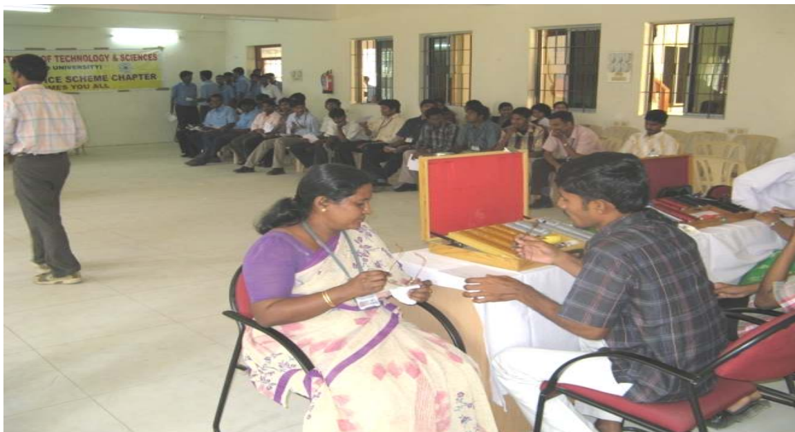
(Free Eye Camp)