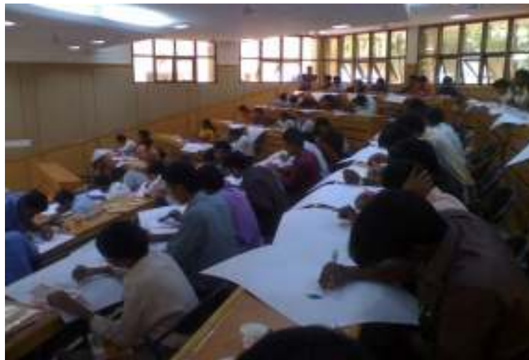
(Students exposing their painting talents on posters)