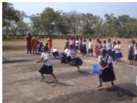
(Conducting sports for students)