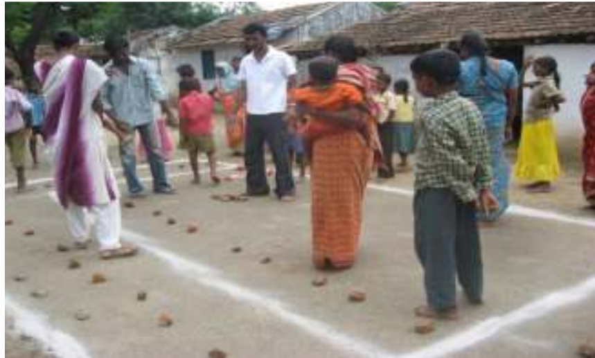
(NSS Volunteer Conducting PRA)

The participatory rural appraisal camp was conducted in a village called Permalkovilpathi. Nearly 20 volunteers attended the camp. The students studied the village very well and interacted with the villagers and noted the needs of the villagers. The students came to know the lifestyle of the people living in the village. The village people participated with a great enthusiasm and with the help of the help of villagers they plotted the village map. The volunteers discussed with the villagers and came to the needs of the village and the problems that they are facing. The problems were noted and perfect data was prepared for the village. The volunteers had their lunch at 1.30 pm. In the afternoon we went to the village and contacted sports for village people and their children.