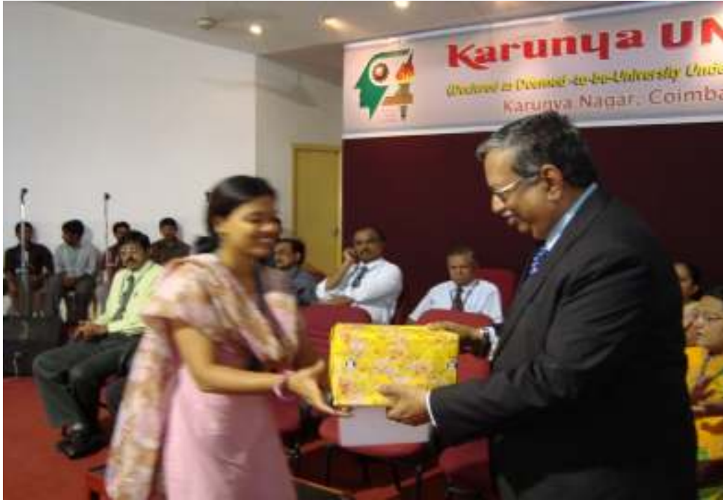
(Prize Distribution during Morning Counseling session)