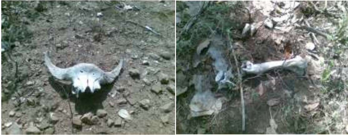
(a skull of the forest bison)