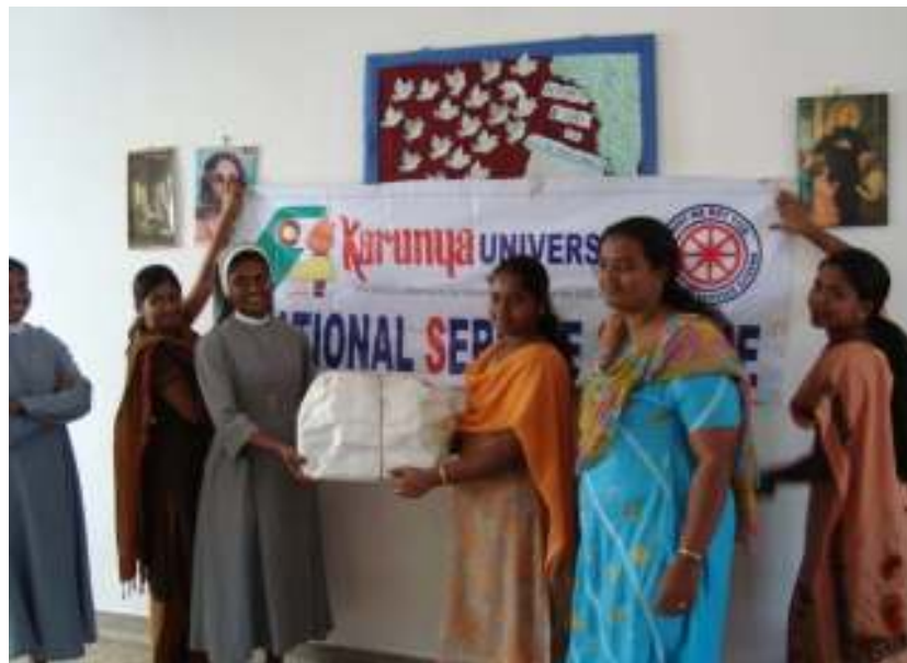
(NSS volunteers gave the home water drums, learning materials etc)

The sisters then thanked us for spending time with them and expressed their gratitude. The visit ended with a word of prayer. The volunteers then took leave from them and returned from there at 2.00 pm. They reached the university by 3.00pm.