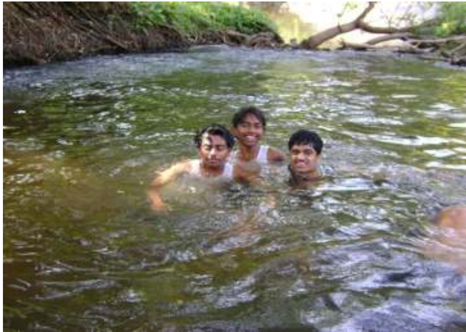
(taking a bath in a river)

At the time 2.00pm the food arrived and we ran and took the first position of the queue. They served a good food, made by their own way of cooking with mud pots. We had enough food and ate until our hunger disappeared. Then we took rest for few minutes and started our journey for the Trekking by 2.30pm. By the way the Forest Ranger accompanied us and came till the check post. Then we moved on the way and went near the river.