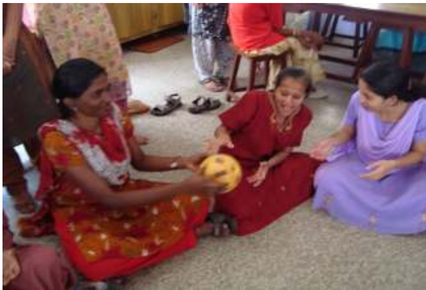
(NSS volunteer conducting games for mentally retarded people)

The visit started with a word of prayer along with the sisters and all the members of the home. Then the volunteers interacted with the sisters of the home to know more about each member and to understand them better. Then the volunteers went around interacting with the members and introducing themselves. The members were happy to have the volunteers in their midst. Then volunteers then sang some songs for the members. The members who knew how to sing were also encouraged to come forward and sing. Then the volunteers did some action songs for the members and they were delighted to see them. As the members could not understand much the volunteers conducted passing the ball for the members and entertained them. The sisters noted that the members were very happy on the day.