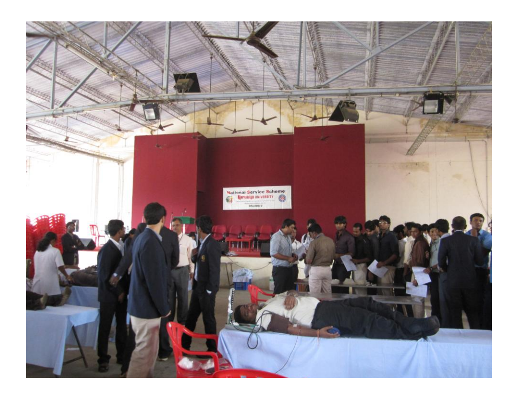
Boys during the Blood Donation Camp on September 3, 2011