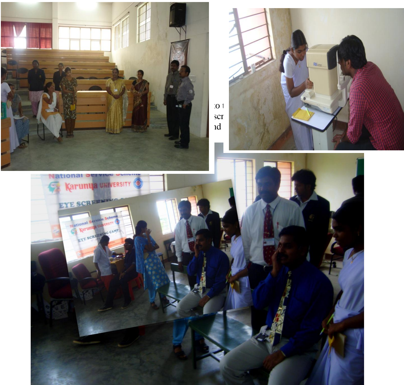
Eye Screening in Progress

5. Visit to Sevalayam, Coimbatore– October 16, 2011