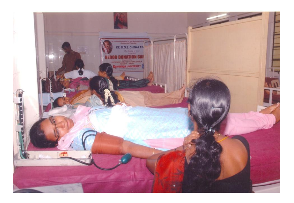
Volunteers donating Blood during the Blood Donation Camp on 1<sup>st</sup> July, 2011