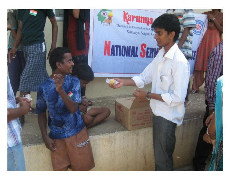
Independence Day celebrations @ Little Hearts, Iruttupallam

A group of NSS volunteers of Karunya University celebrated the Independence Day along with the inmates of Little Hearts, a home for mentally challenged at Irutrupallam. It was a most satisfying day for the students after spending time with the children at the home.