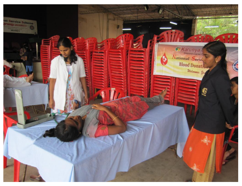
Girls donating blood during the Blood Donation Camp on September 3, 2011