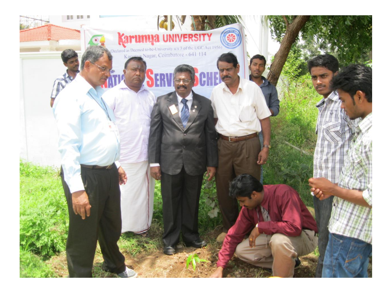
Tree Plantation at Angel Garden, Karunya Nagar