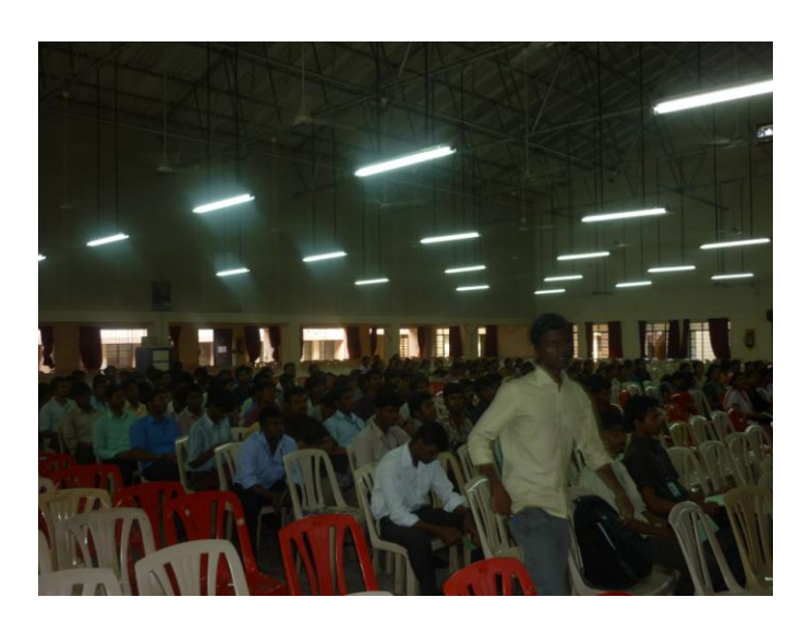
Students listening to the Seminar and the Discussion session